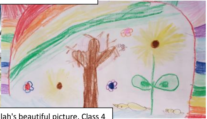
Talah's beautiful picture, Class 4