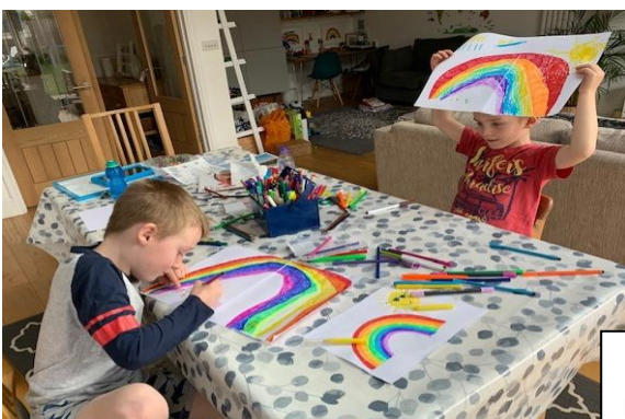
Brothers from class 2 and 9 working hard together.