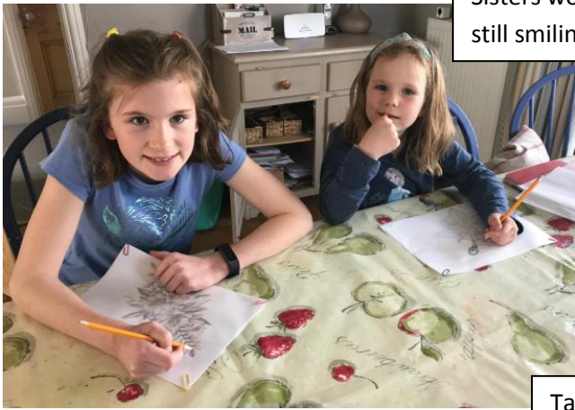
Sisters working hard together and still smiling!!