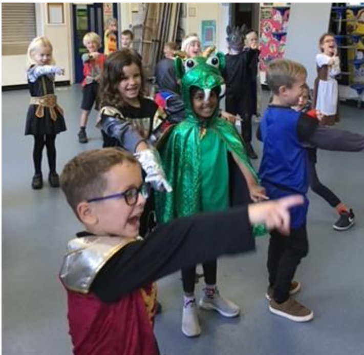
Year 1 Wow Day-what would you like to be when you grow up?