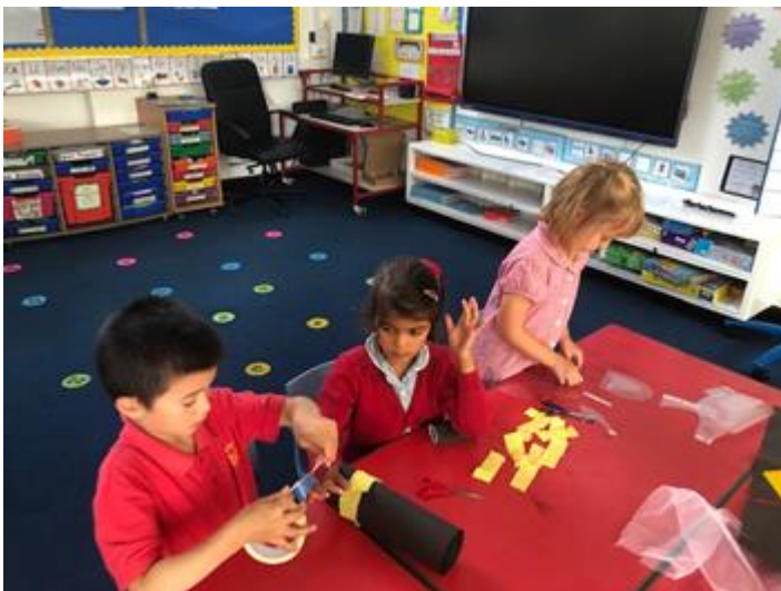
Reception learning and playing with new friends