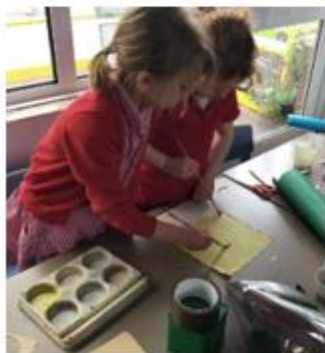
Teaming up to create our whole-school past and games children have play