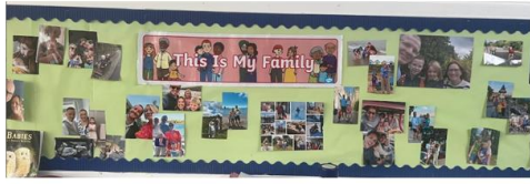
Reception are sharing information about their families; getting to know each other by talking about their own history.

As a school we are focused on ensuring that each subject within our curriculum is as strong as it can be and every year we turn our focus to one or two 'spotlight subject' to more closely examine what is in place. Last year, there was a larger focus on computing and writing, this year we have turned our attention to science and within maths, how we teach number facts. As we are now collaborating with other CST schools, we are taking the opportunity to learn from other schools' strengths. From this we are implementing a new science curriculum that we believe is better sequenced and as ambitious as our previous one. Throughout the year we hope to inspire and excite children through their science learning and hope this is reflected in their conversations at home.