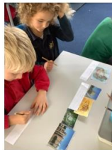
As part of the Knights and castles topic Year 2 are learning about the changes in castle design over time; looking at materials, shape and defence features.